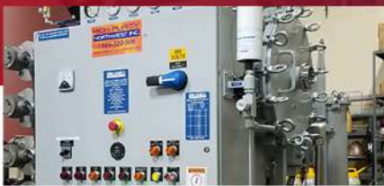
Transformer Oil Flusing Services