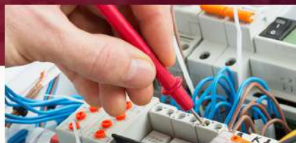
E & I Services