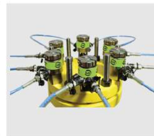
Bolting and Tensioning Tools