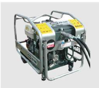
Hydraulic Power Packs