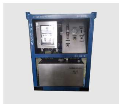
Hydraulic Power Packs